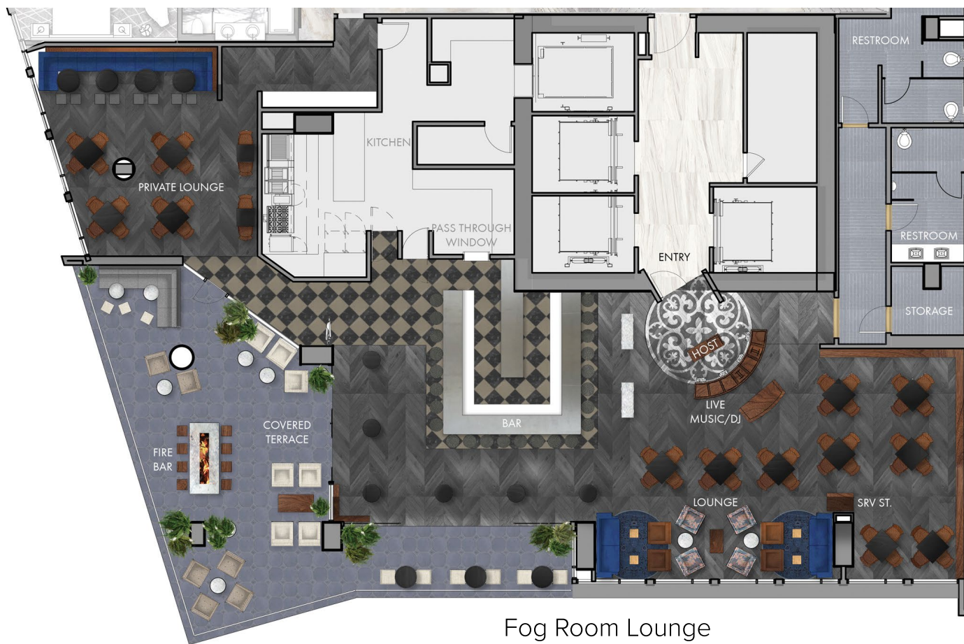
Fog Room Lounge